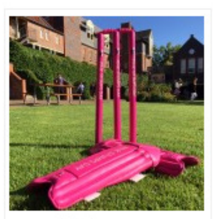
Pink Stumps Day