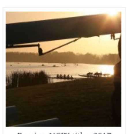
Rowing NSW titles 2017