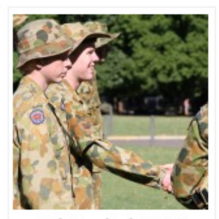
Cadet Leadership 2017