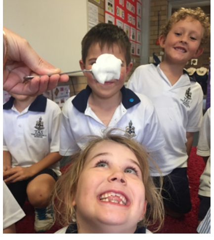
L: Year 1- What force is needed to make egg whites stiff?