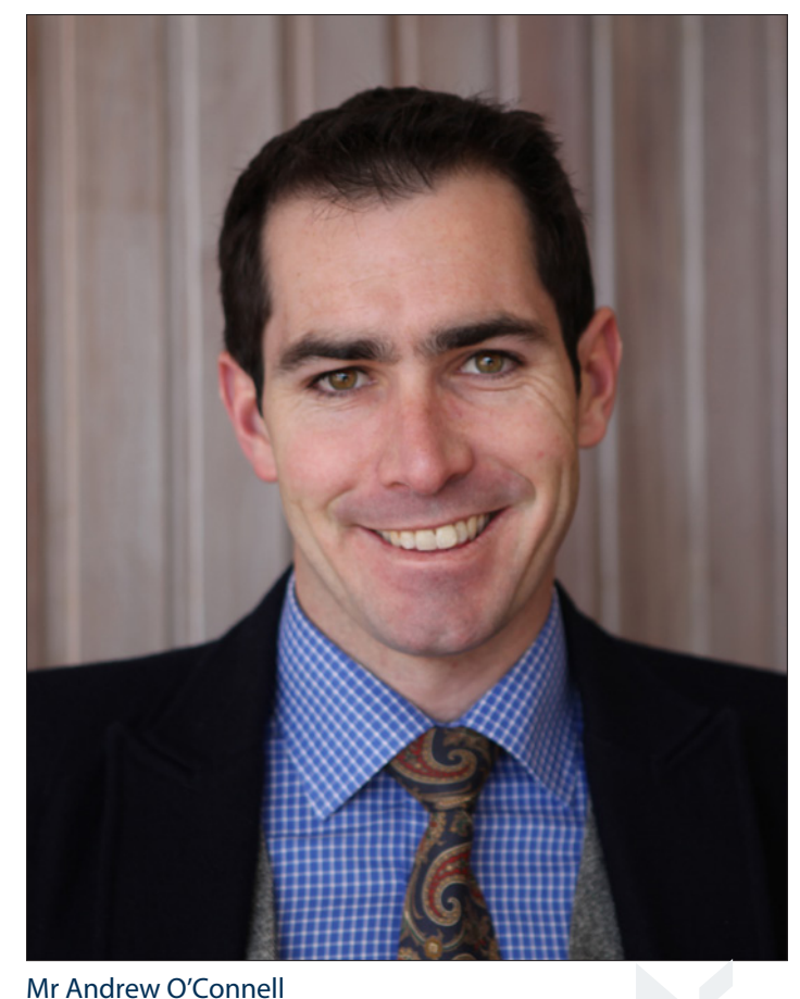
Creative Arts Coordinator

Next week we are hosting the Cyclone Pam fundraiser presented by SEIA and BackTrack. The fundraiser is about continuing the work started in Vanuatu back in 2015 with funds needed for materials, shipping and hopefully sponsoring some young people of BackTrack to go across and have an amazing experience developing skills while giving back to that community. The evening will involve the fan-favourite dog jumping of BackTrack, raffles, a choir of singers from Vanuatu and the international release of the film The Storm that Time Forgot, a documentary on the first project trip. Tickets are available at the Hoskins Centre website and all proceeds go to this fantastic cause.