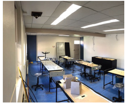
Creating the new Science lab