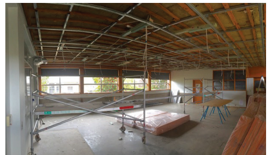
Refitting the top of Cash Building