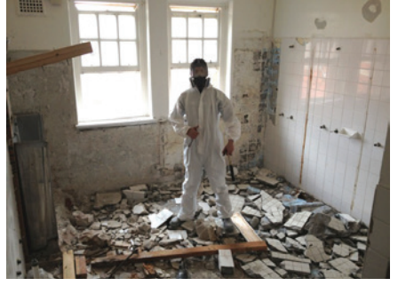
Over the past decade every single bathroom at TAS has been replaced at a cost of almost $750,000