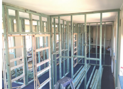
Top Moyes becomes senior girls' boarding