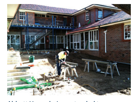
Abbott House being extended to improve residential life