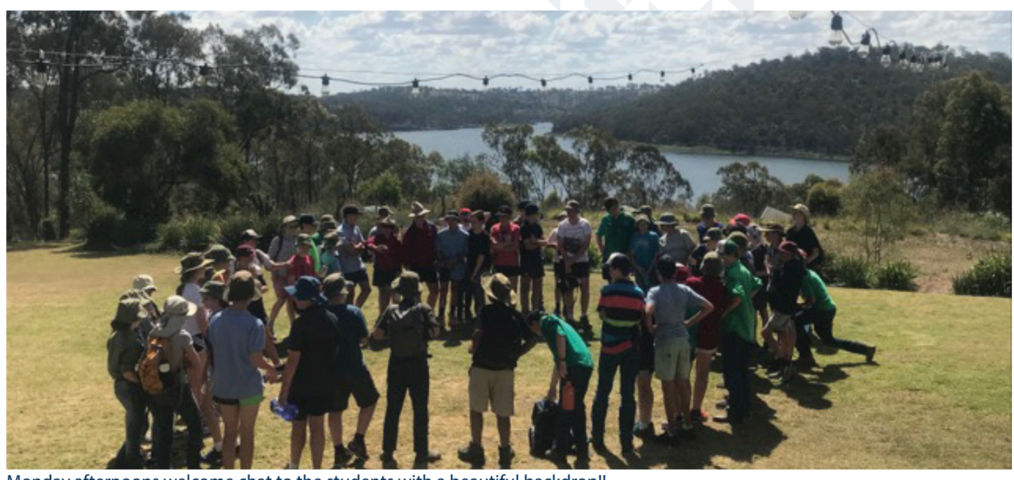
Monday afternoons welcome chat to the students with a beautiful backdrop!!