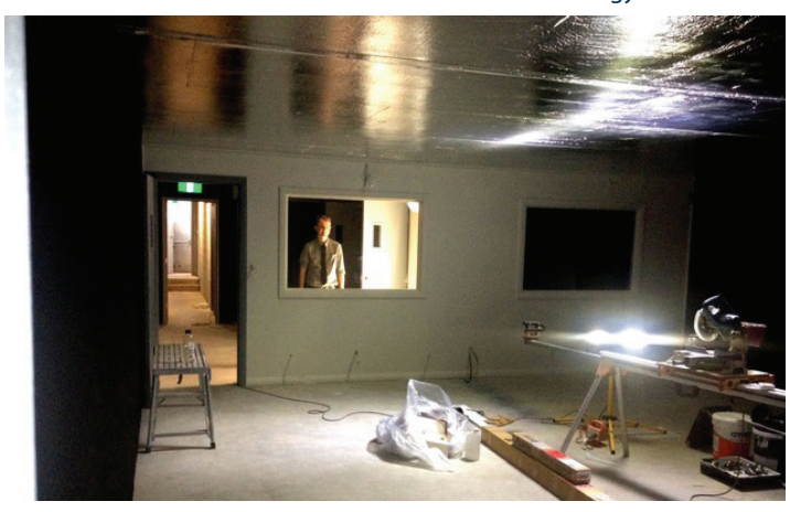
The production studio takes shape in the basement of the Hoskins Centre