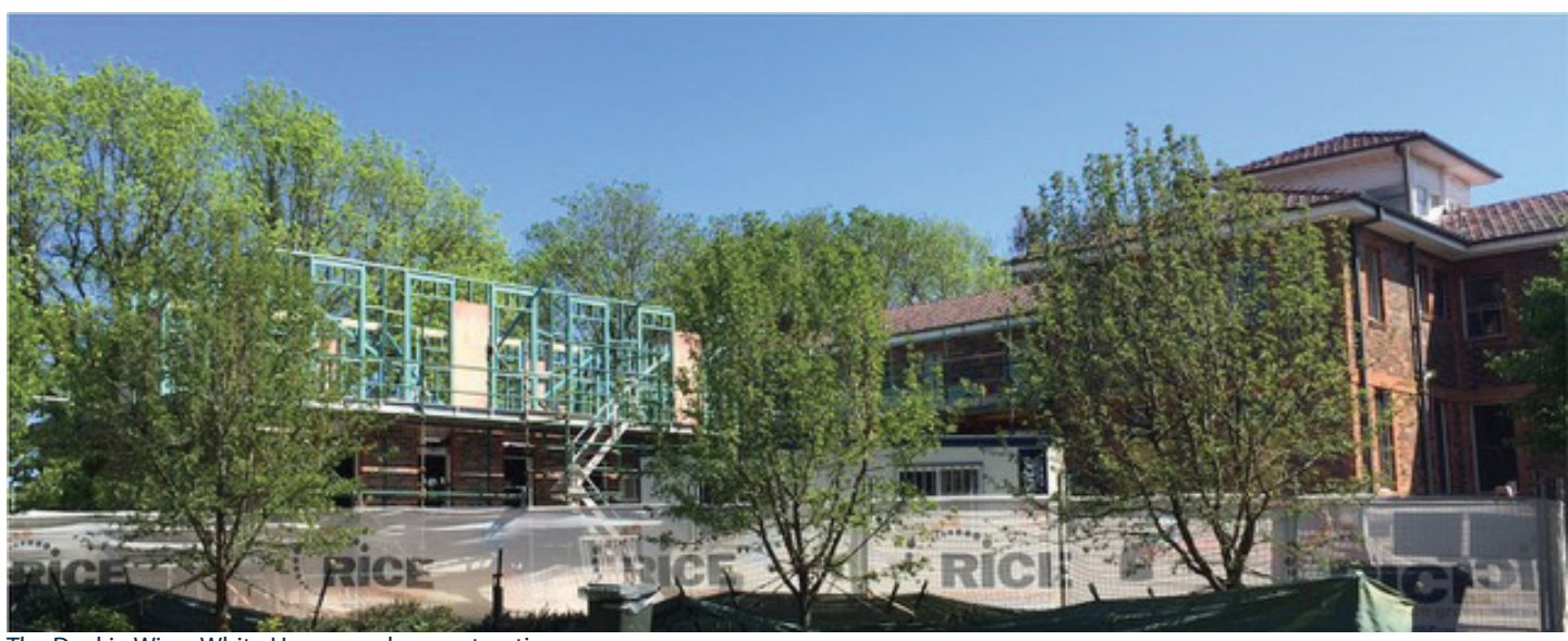
The Deakin Wing, White House, under construction