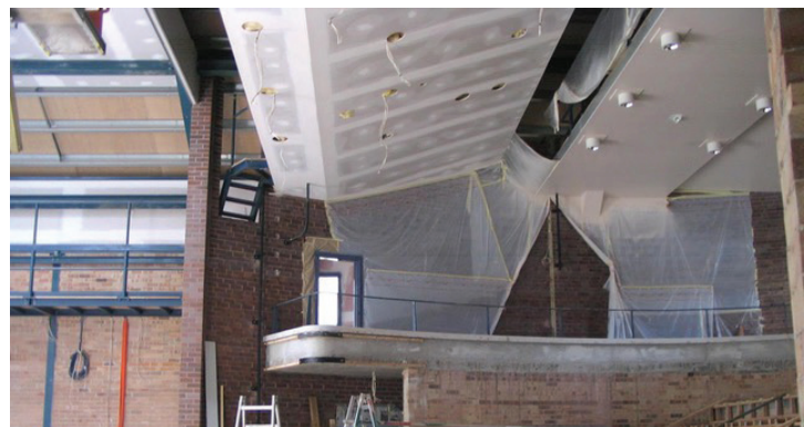
Hoskins Centre theatre under construction