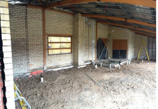
Creating new girls' changeooms in the eastern