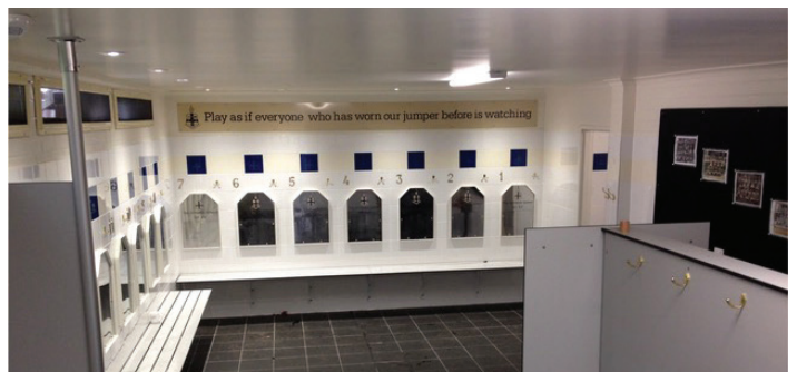
Pride of workmanship in the Backfield rugby changerooms