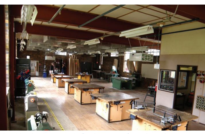
The old technology room before being transformed into the Year 12 Common Room and Study Centre