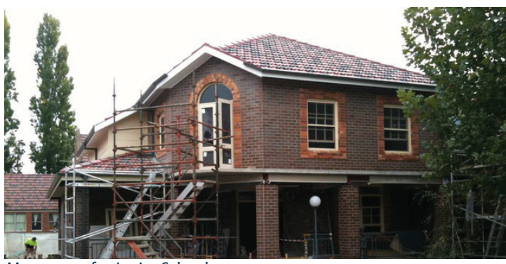
More space for Junior School