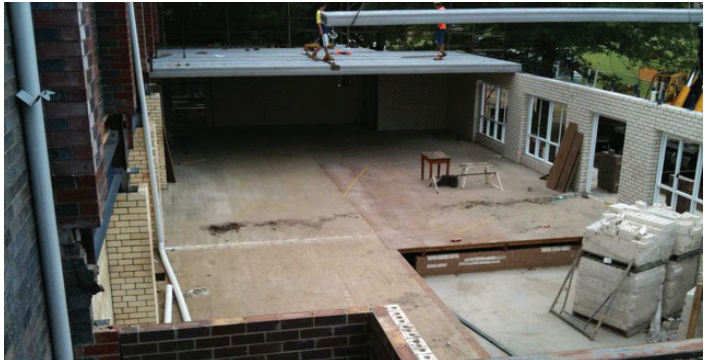
Eastern extensions to the gymnasium