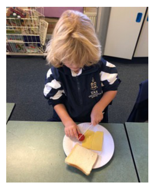
Exploration of halves in Kindergarten