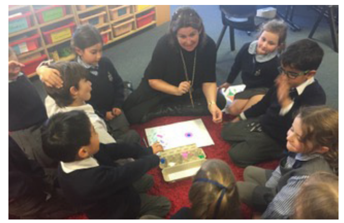
Year 1 discussed and inquired into 'community circles' using Visual Arts.