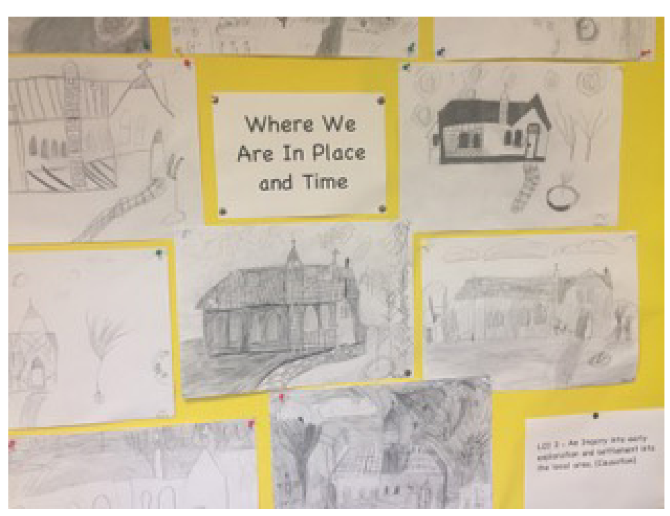
Year 3 have been for a history walk around TAS and inquired into the history of some buildings including the TAS Chapel. They reflected on their excursion through visual arts.