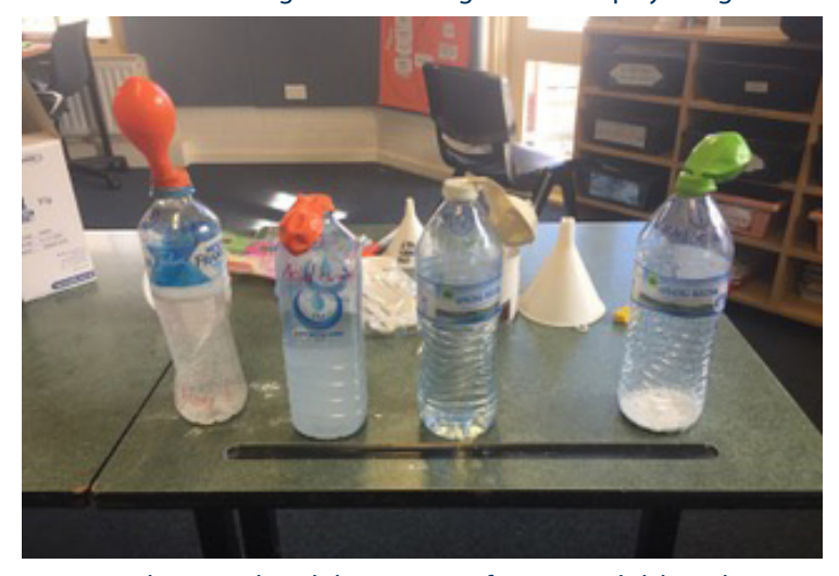
Year 4 VW have explored the 3 states of matter, solid, liquid and gas.