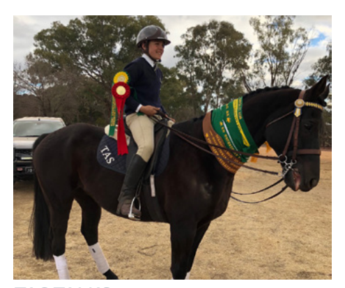
TAS TALKS | 14