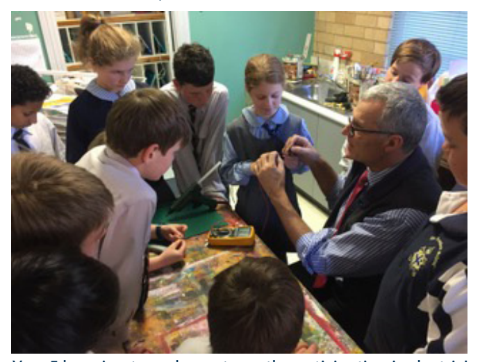
Year 5 learning to make motors - the anticipation is electric!