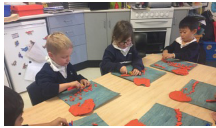
Transition children used their senses to feel play dough. They also used their sense of sight to find the glitter in the play dough.