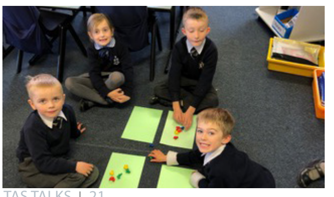
R: Kindergarten starting their new unit on multiplication and division. Putting farm animals in their paddocks in equal group