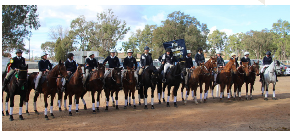
The Team (2018)