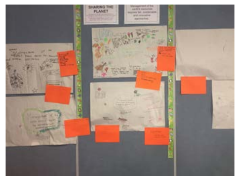
Year 5 unpack their central idea and mind map focus areas they could inquire into to develop a greater understanding.