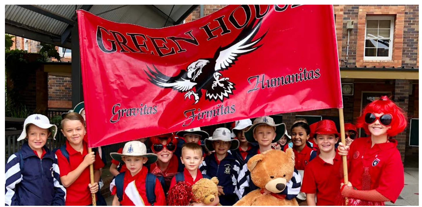
Green House were very competitive on the day coming second in the House Championship