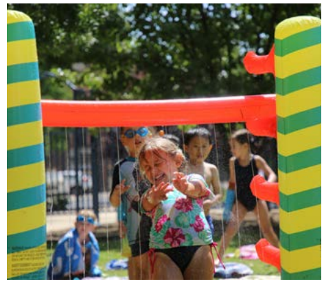
Kindergarten- learning about all the things they can do whilst enjoying water play.